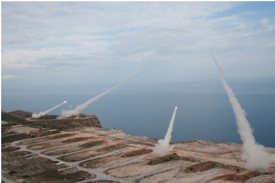
The Hellenic Army conducting missile firings with AH-64 Apache attack helicopters using air-to-surface anti-armor missiles at NAMFI.

The only place in Europe where missiles can be test fired is the NATO Missile Firing Installation (NAMFI), 26 one of the few ranges on earth that can host almost every type of activity on the ground, surface and air. NAMFI can host ground-to-air, ground-to-surface, surface-to-surface, air-to-surface, and torpedo firings along with experimental firing activities, joint live fire exercises, certifications of airborne and seaborne target drones, and personnel and units. Six airborne targets can be used simultaneously to practice for complex threats, good weather conditions allow for year-round operations, and the orientation and size of the facility allows for the maximum range of weapon systems. The Hellenic Air Force wing and NMIOTC are located close by, allowing troops returning from war zones or participating in NATO operations to combine multidimensional exercises with missile firing practice. NAMFI has served over 400,000 trainees and more than 70,000 visitors.