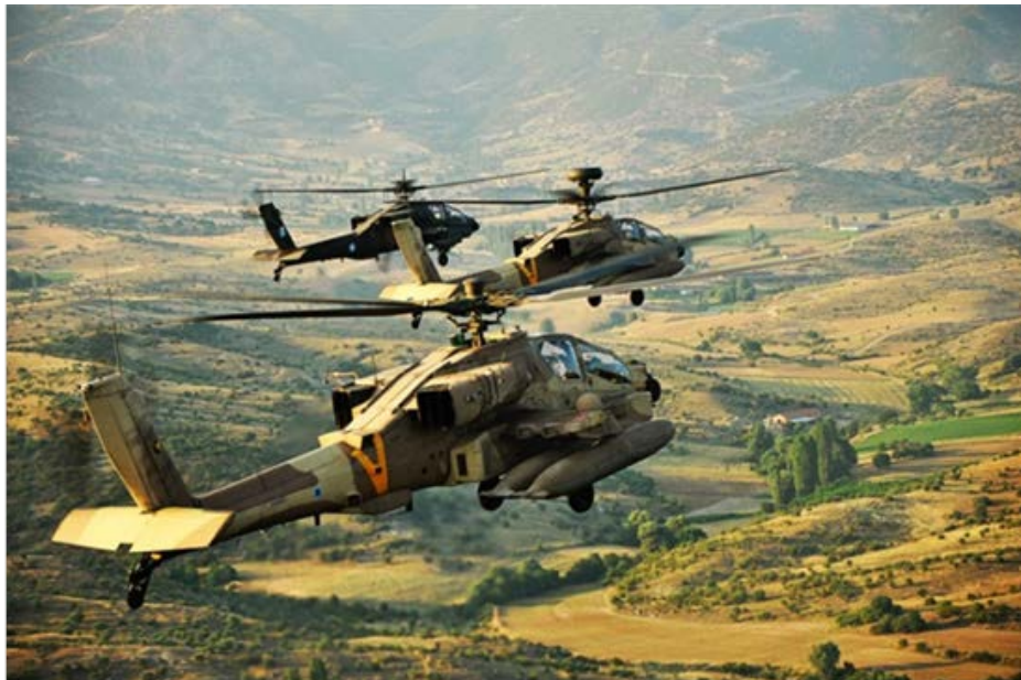
Israeli and Hellenic Apache helicopters fly together in a joint aerial exercise -- such drills are central to their military cooperation.

In 2014, Greek, American, European, and North African naval forces participated in the eighth Phoenix Express exercise to increase maritime safety and security in the Mediterranean Sea. That same year, the Hellenic Navy and Air Force and the Standing NATO Mine Countermeasures Group Two conducted a national exercise to upgrade operational cooperation of naval and air units, the U.S. and Hellenic Air Forces participated in NATO training at the Souda Bay air base to share tactics and procedures, and the Hellenic Navy and the Royal Task Force conducted Cougar 2014 in the Ionian Sea to practice technical exercises.